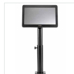
Variable height adjust (pole type)