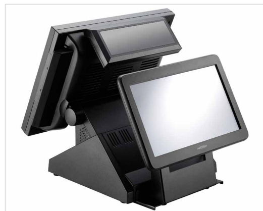
Dual Display Monitor Stand